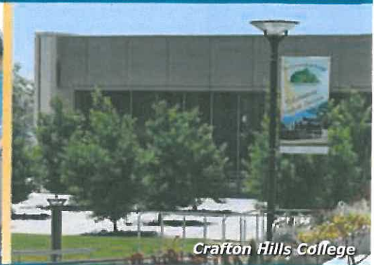
Crafton Hills College