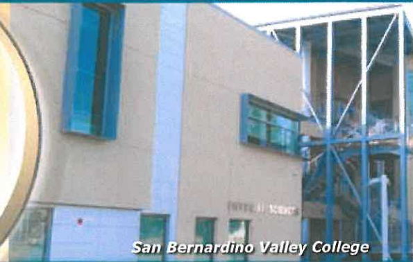
San Bernardino Valley College